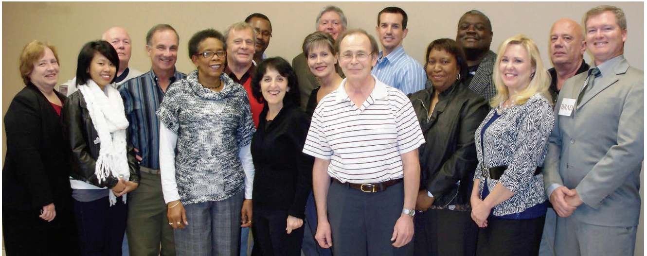
Members from four clubs joined in the celebration of Gulf Coasts Toastmasters' 40th anniversary.

Other Clubs represented at this gathering were the Bienville Club (Ocean Springs, MS), the VA Club (Biloxi, MS), and Speakeasy (Stennis Space Center, MS).